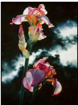
Linda Moyer: Iris

The Southern Watercolor Society’s 31st Annual Juried Exhibition and Linda Moyer Workshop will be upon us in a very short time. The slide entry deadline is December 5th (just over 2 weeks away); the workshop is filling fast (send your registration now!); and the show entries are arriving daily (get your 35mm slides made!).