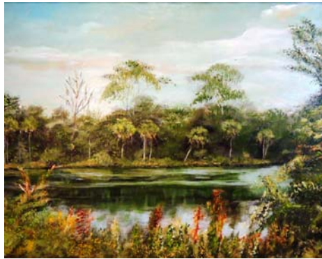
Landscape Study 2 by Deb Brien