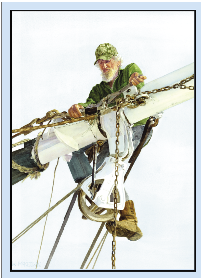
TaWS's 2010 Brush Strokes Juried Member Exhibit