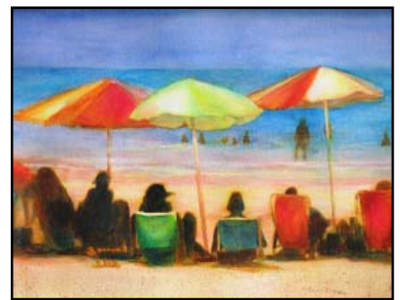
Rhetta Rudy, Summertime